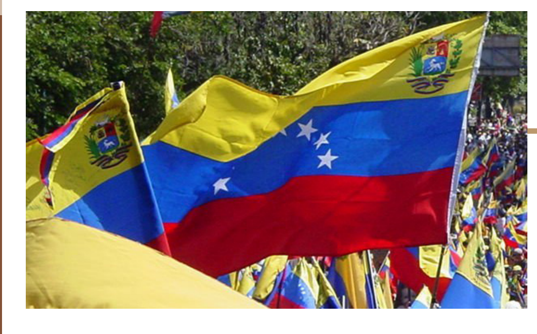
Venezuelans take the Capital's streets to express their political views