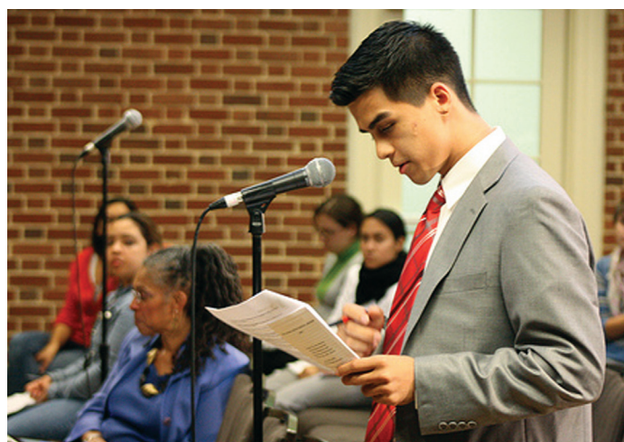
UMD student and staff member offers a question to the panel