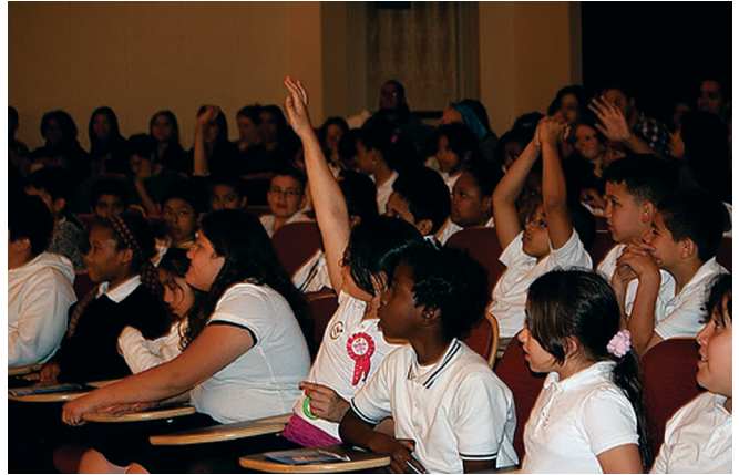
Local elementary students get involved