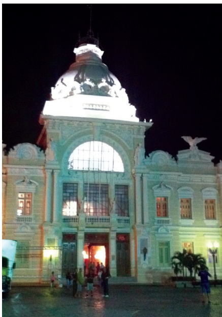
The Igreja do Nossa Senhor do Bomfim, Salvador, Bahia