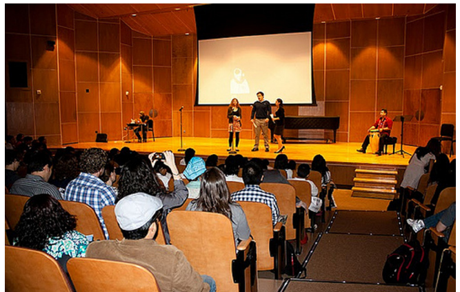
Students perform in front of a full house