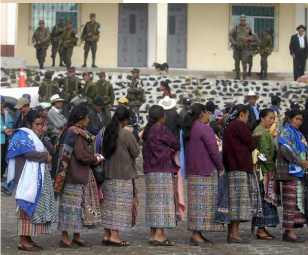
Women line up to vote in the second round of the Presidential elections

In contrast, Colom Argueta has a history of support for reformist politics and indigenous rights, and he even came in 3rd place in 1998 on a coalition leftist ticket. Colom also trained as a Mayan spiritual guide, and seems disposed to open unprec-