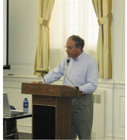
Tomás Hirsch during his presentation at McKeldin Library

Tomas Hirsch is presently a member of the Humanist International. He is dedicated to promoting the regional organization of Latin-American Humanist Parties and Social Organizations. In 1983 he helped found the Chilean Humanist Party, becoming its president from 1994 to 1999. He was also one of the founders of the Coalition of parties for Democracy (CPD) and served as Chile's ambassador to New Zealand between 1990 and 1992, under the democratic government of Patricio Alwyn.